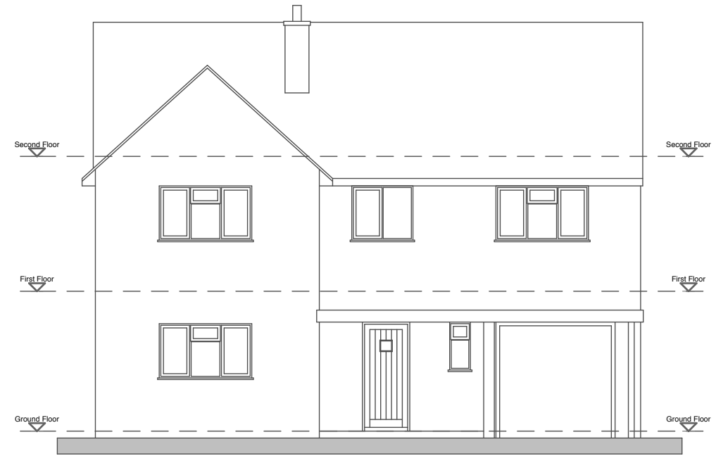
EXISTING NORTH ELEVATION 1:100