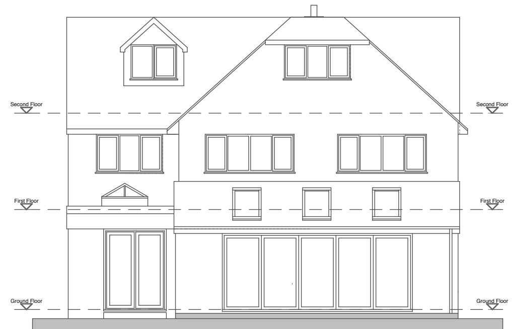
EXISTING SOUTH ELEVATION 1:100