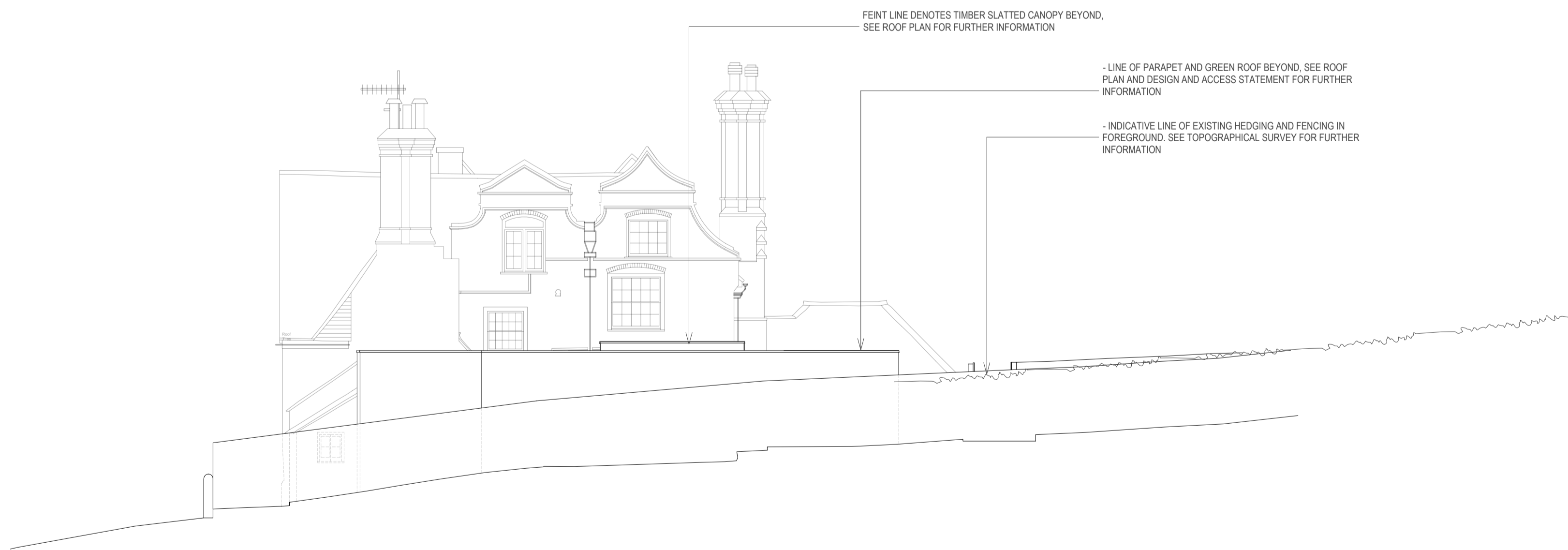
NORTHWEST-FACING ELEVATION - AS PROPOSED SCALE @ 1:100 ON AN A1 SHEET

NOTES. DO NOT SCALE OFF THIS DRAWING CHECK ALL DIMENSIONS ON SITE BEFORE ANY WORK IS COMMENCED. ALL GOODS MATERIALS AND WORKMANSHIP MUST CONFORM WITH CURRENT BUILDING REGULATIONS, BRITISH STANDARDS AND CODES OF PRACTICE. R.I.B.A BASIC SERVICES GIVEN/ NOT GIVEN. COPYRIGHT OF THIS DRAWING IS RETAINED BY GEORGE BAXTER ASSOCIATES LTD. AND IT MUST NOT BE REPRODUCED WITHOUT WRITTEN CONSENT.