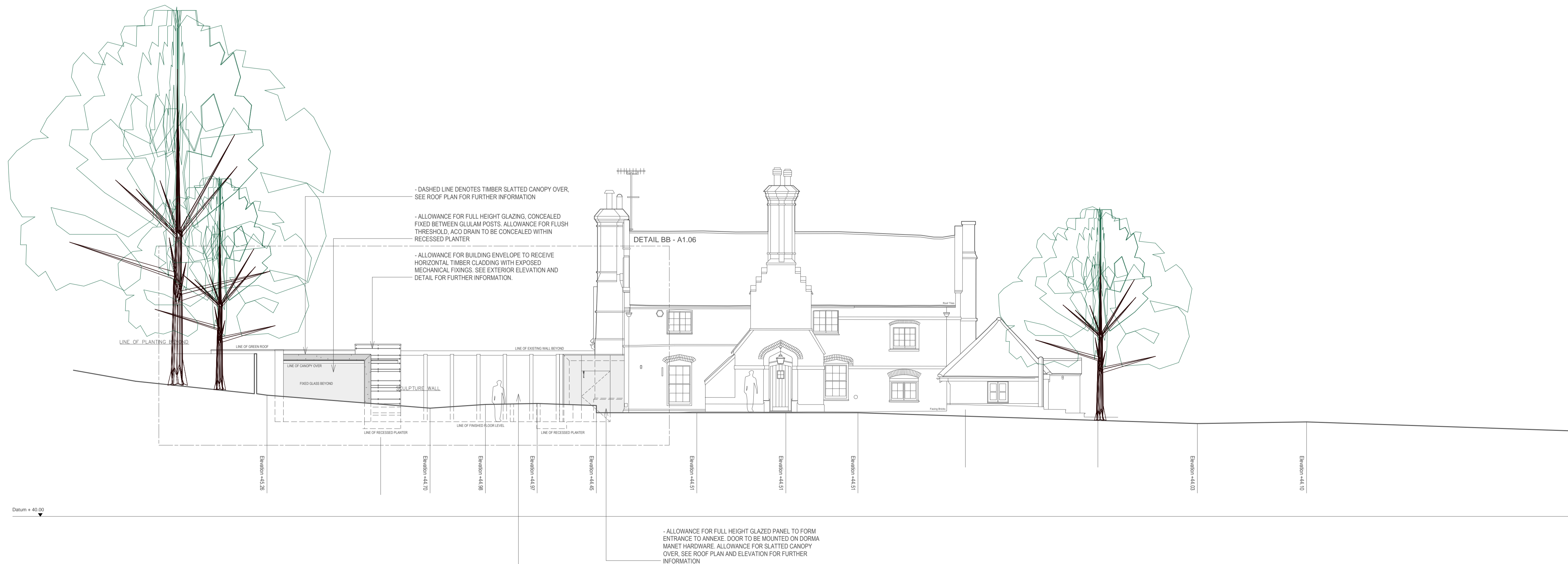
SOUTHWEST-FACING ELEVATION - AS PROPOSED SCALE @ 1:100 ON AN A1 SHEET

NOTES. DO NOT SCALE OFF THIS DRAWING CHECK ALL DIMENSIONS ON SITE BEFORE ANY WORK IS COMMENCED. ALL GOODS MATERIALS AND WORKMANSHIP MUST CONFORM WITH CURRENT BUILDING REGULATIONS, BRITISH STANDARDS AND CODES OF PRACTICE. R.I.B.A BASIC SERVICES GIVEN/ NOT GIVEN. COPYRIGHT OF THIS DRAWING IS RETAINED BY GEORGE BAXTER ASSOCIATES LTD. AND IT MUST NOT BE REPRODUCED WITHOUT WRITTEN CONSENT.