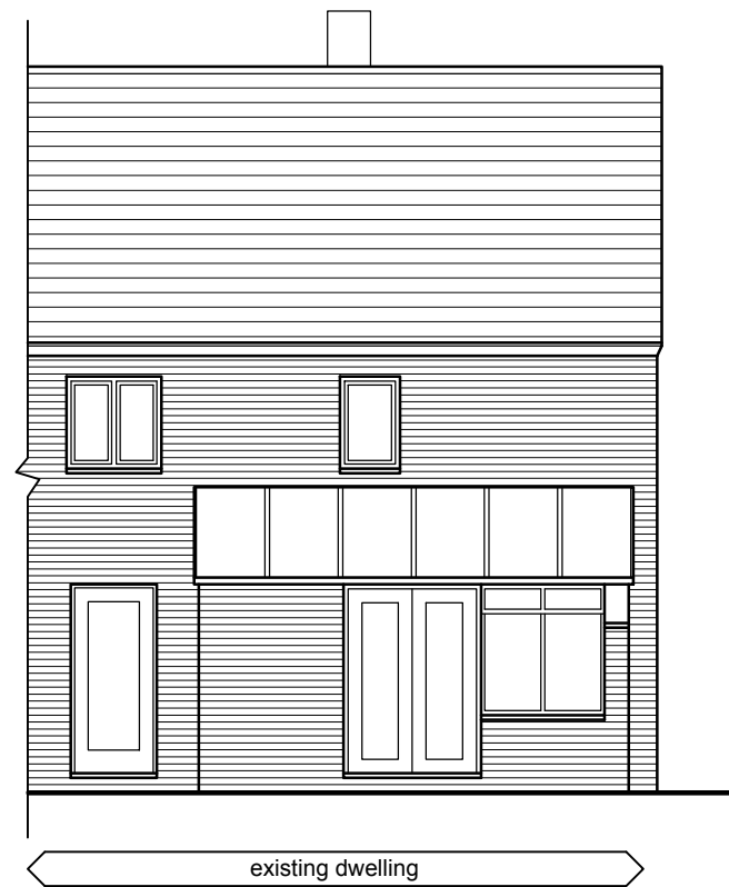
Rear Elevation (South)