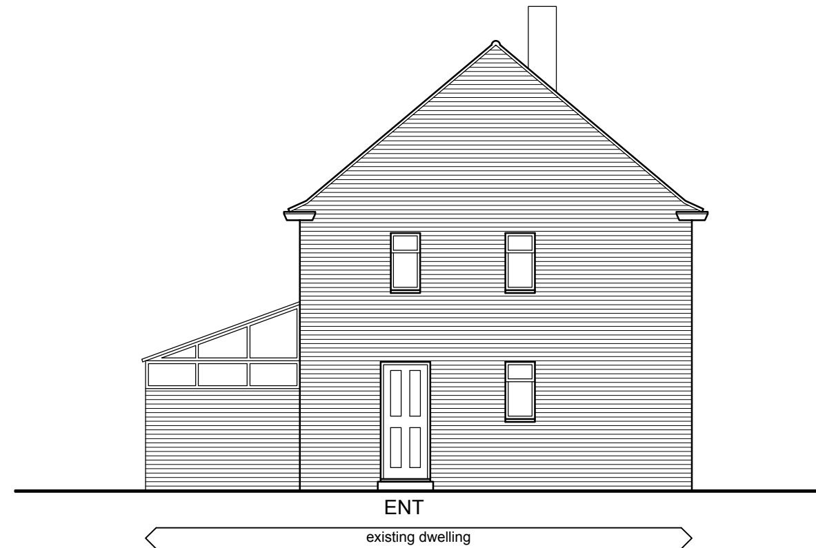
Flank Elevation (East)