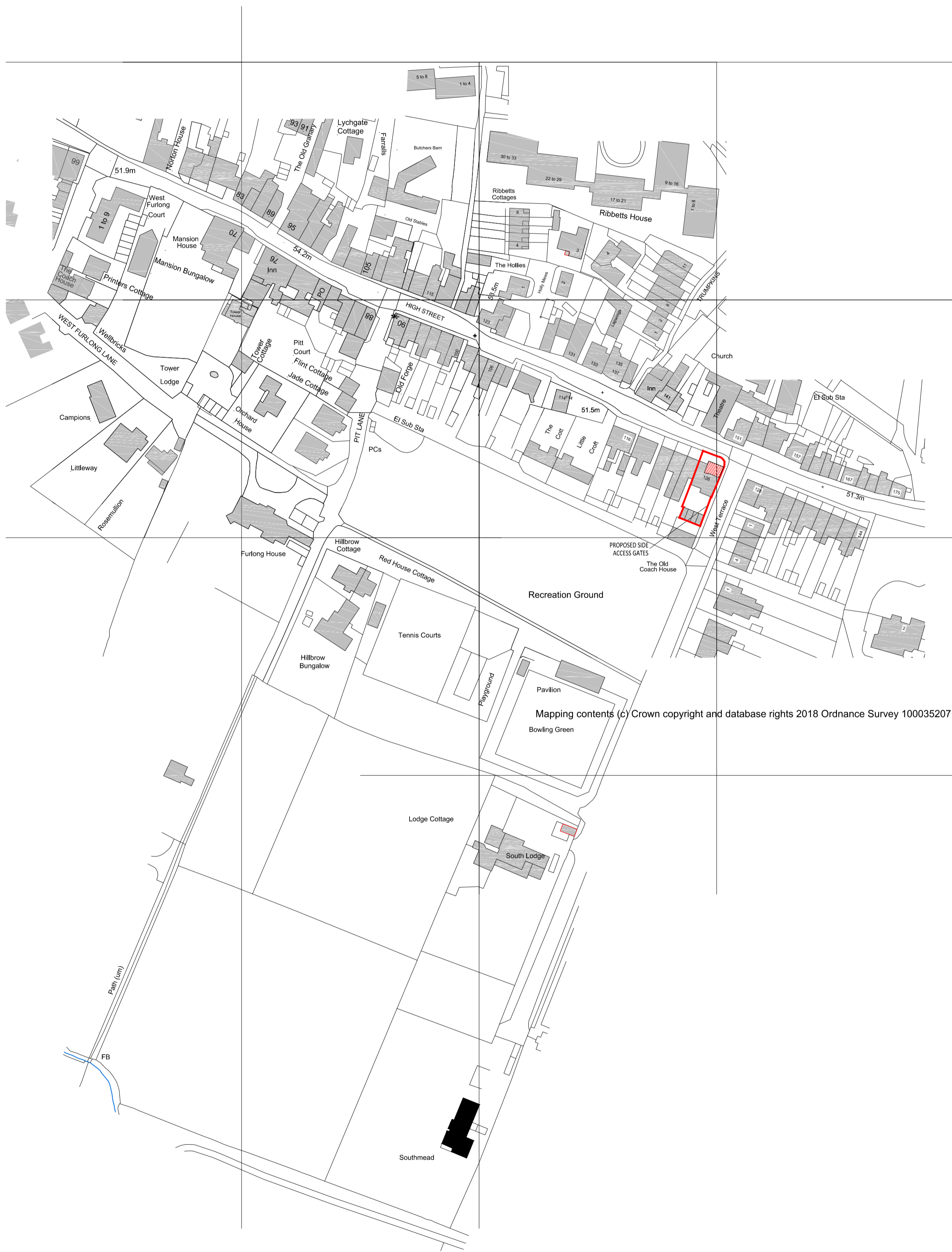
SITE LOCATION PLAN - AS PROPOSED SCALE @ 1:1250 ON AN A1 SHEET