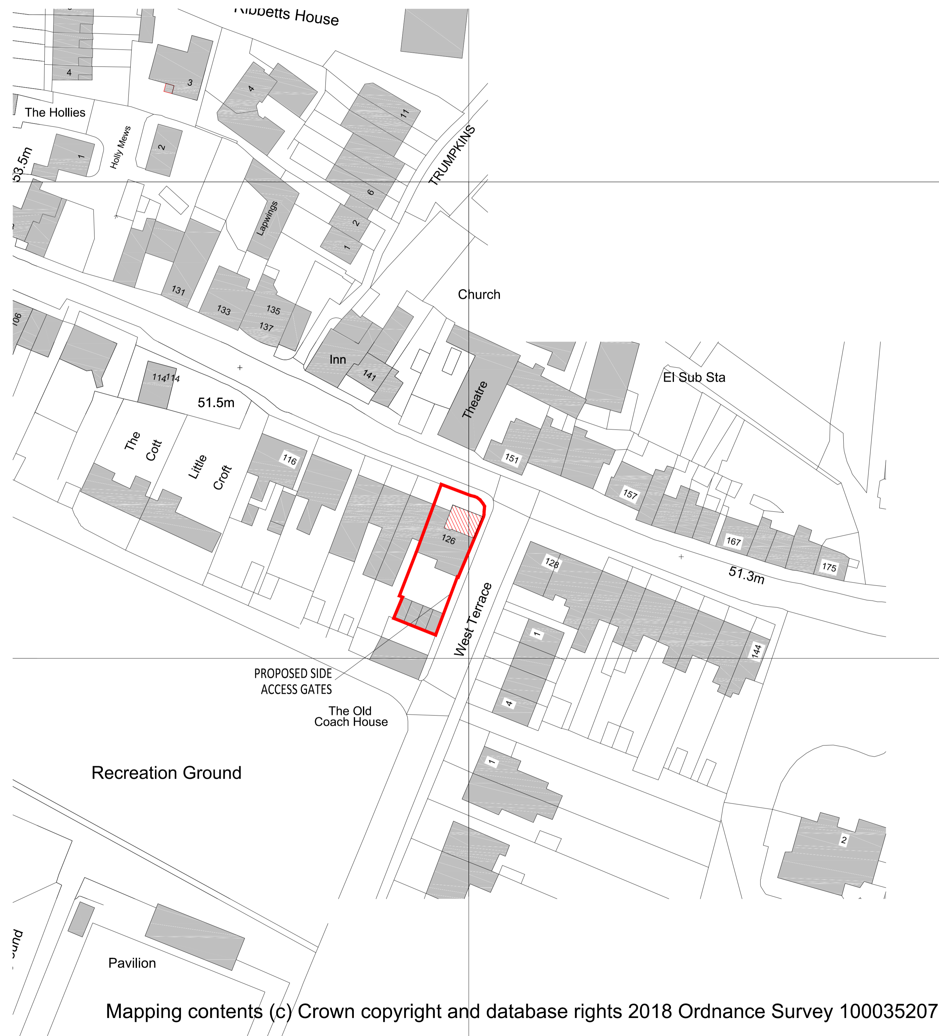
SITE BLOCK PLAN - AS PROPOSED SCALE @ 1:500 ON AN A1 SHEET