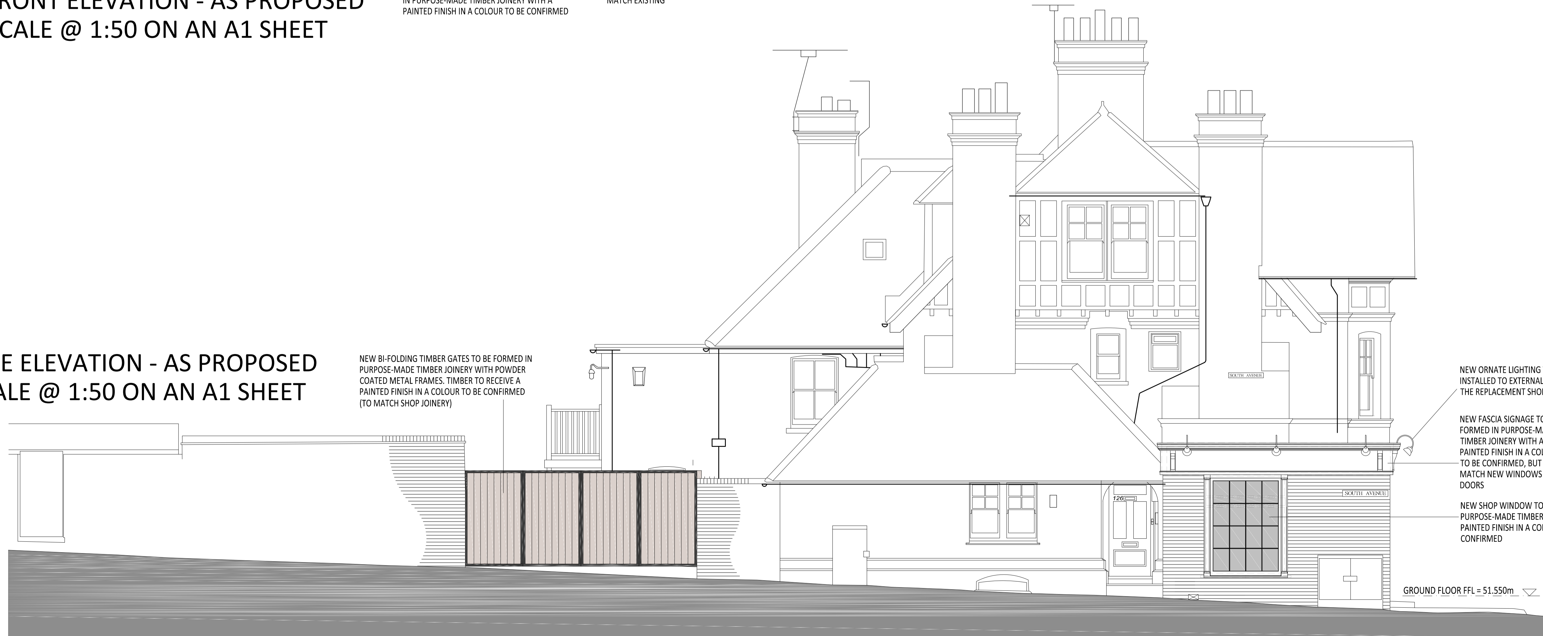
SIDE ELEVATION - AS PROPOSED SCALE @ 1:50 ON AN A1 SHEET