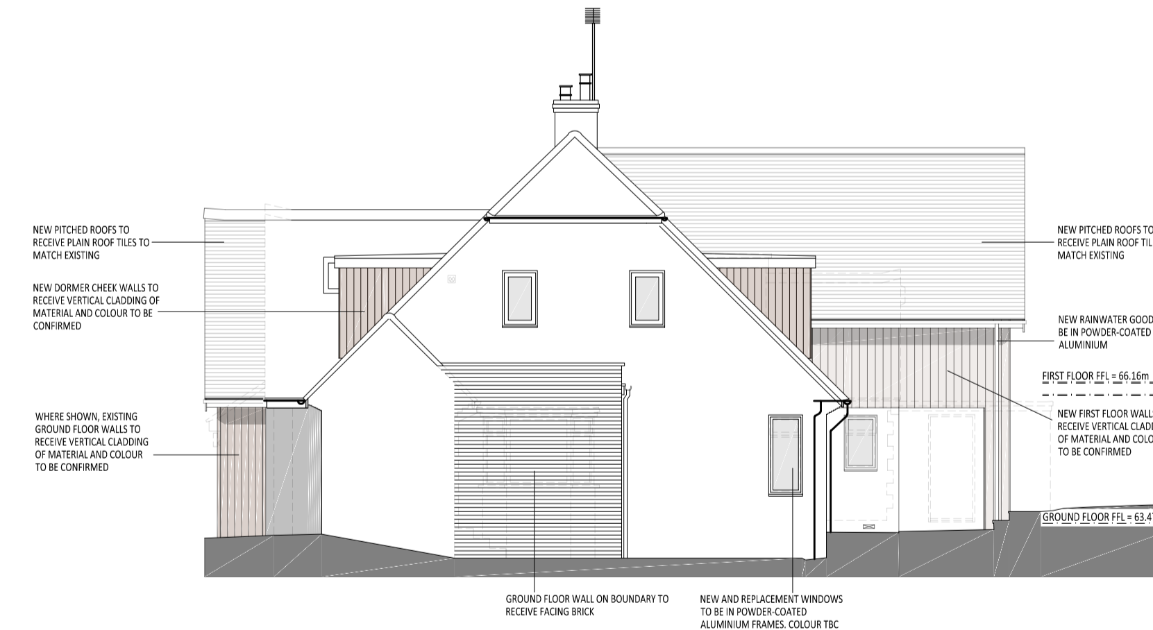
SIDE (WEST-FACING) ELEVATION - AS PROPOSED SCALE @ 1:100 ON AN A1 SHEET