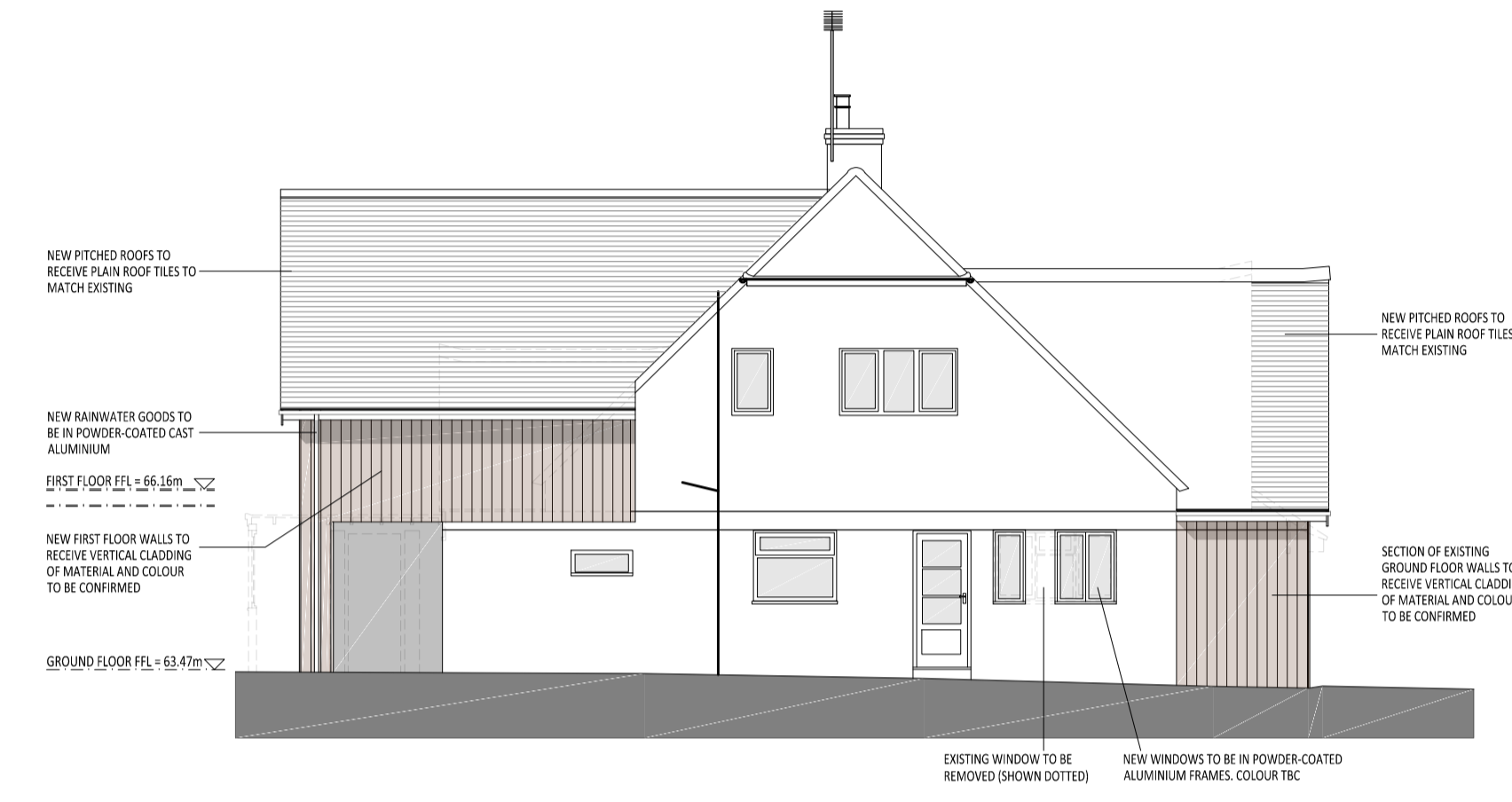
SIDE (EAST-FACING) ELEVATION - AS PROPOSED SCALE @ 1:100 ON AN A1 SHEET