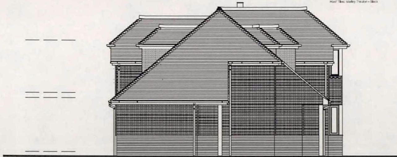
SIDE (North East) ELEVATION