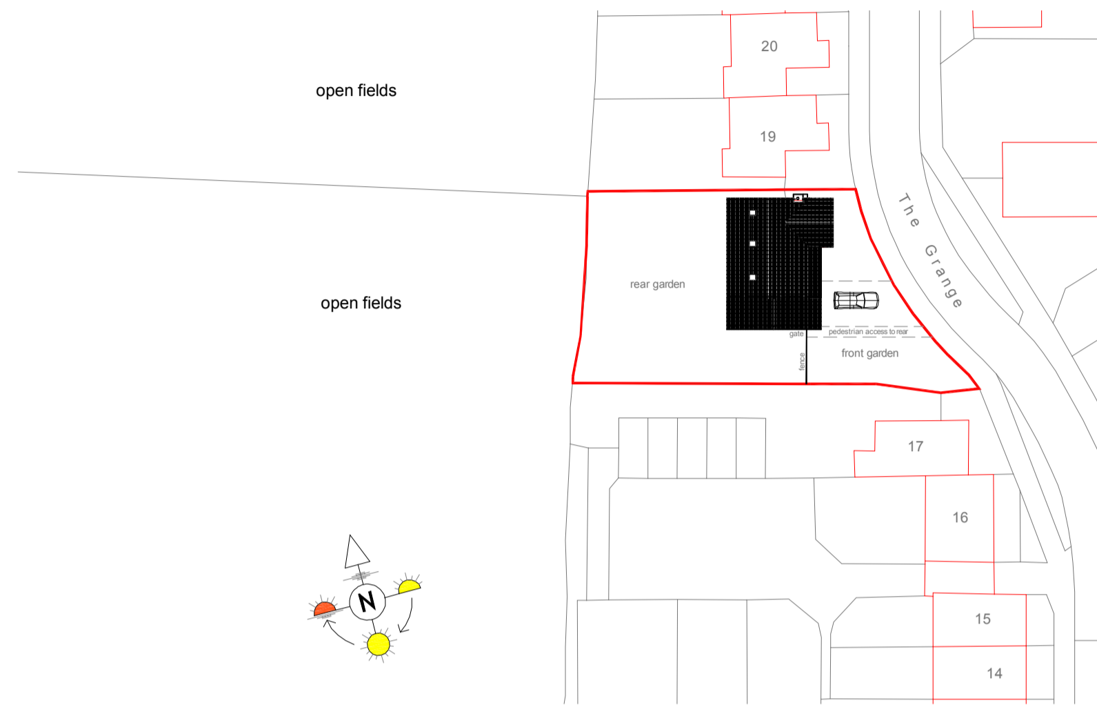
Existing Block Plan - Scale 1-500