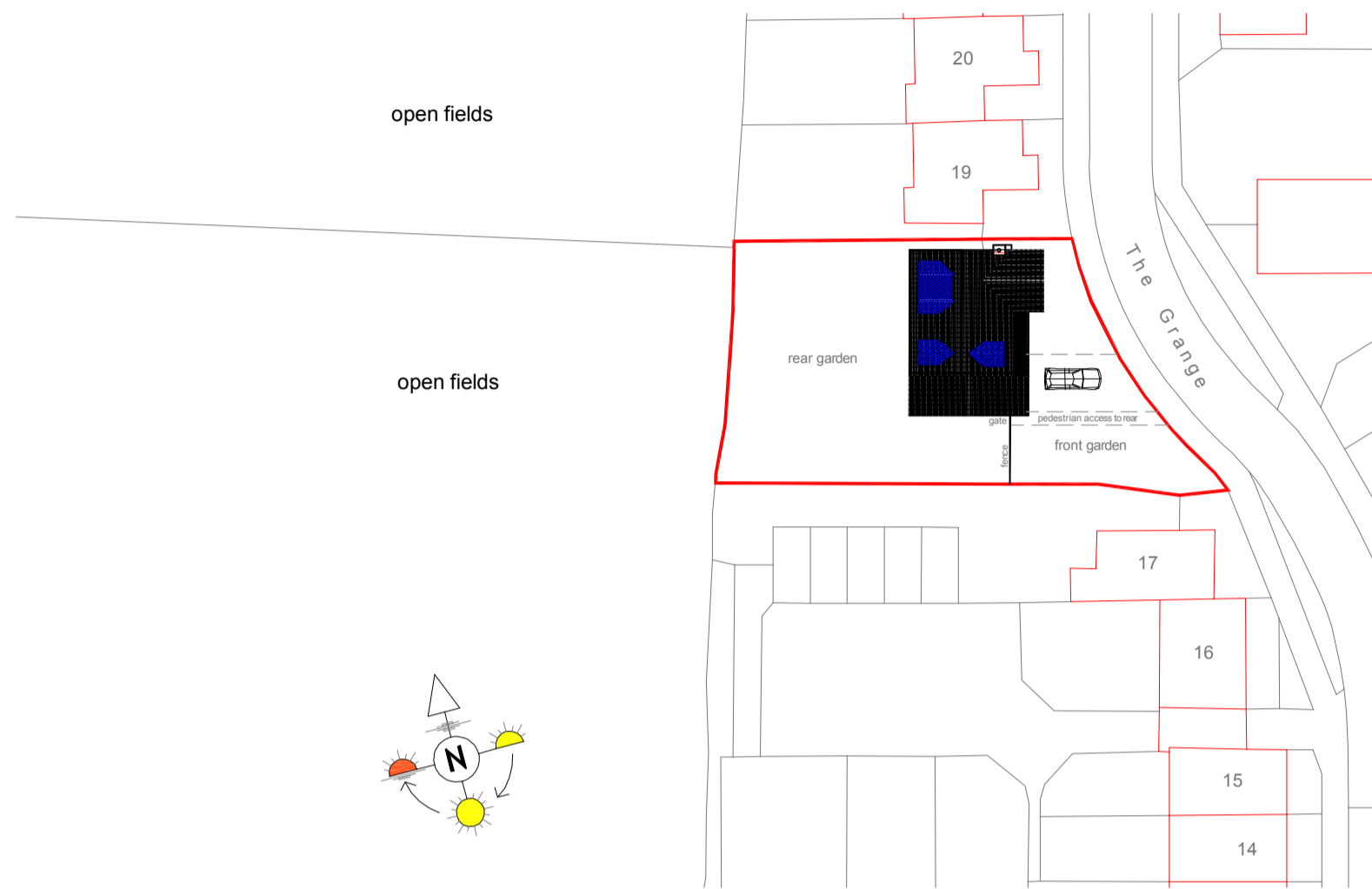
Proposed Block Plan - Scale 1-500