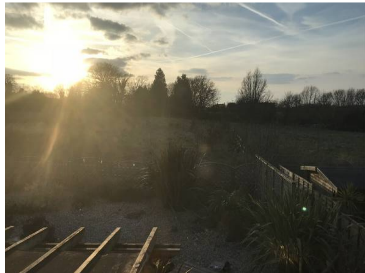
View of open fields from rear garden facing west