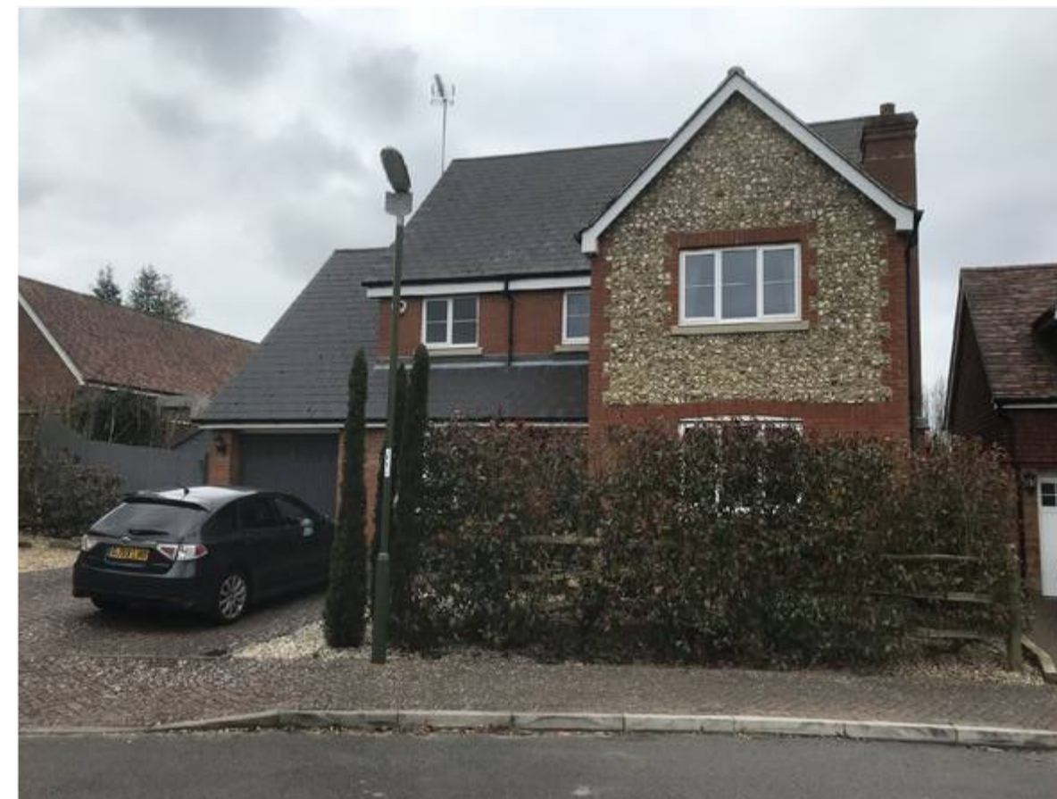
Existing Front Face 1