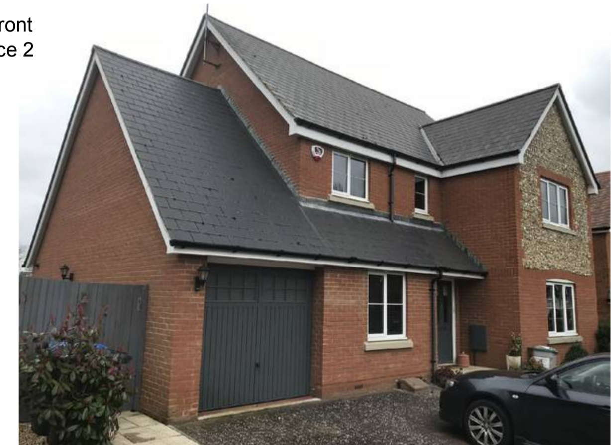
Existing Front Face 2