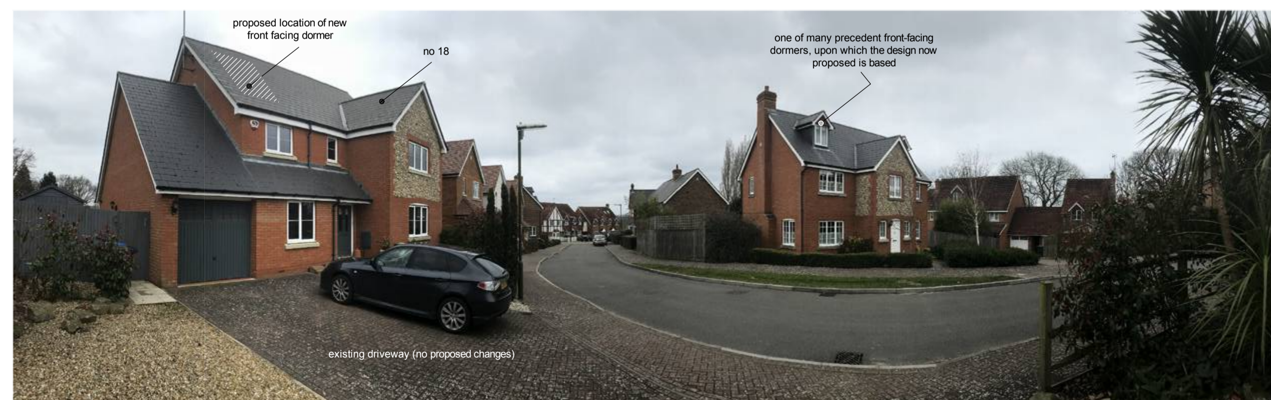
Panoramic of front