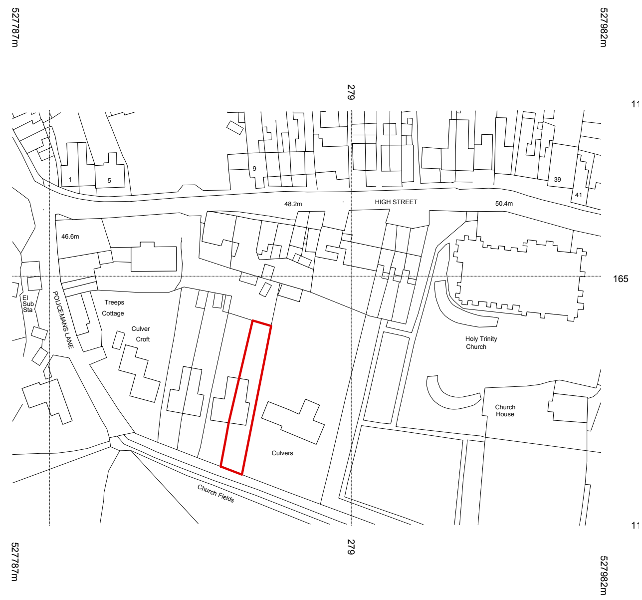
01 Location plan 1:1250