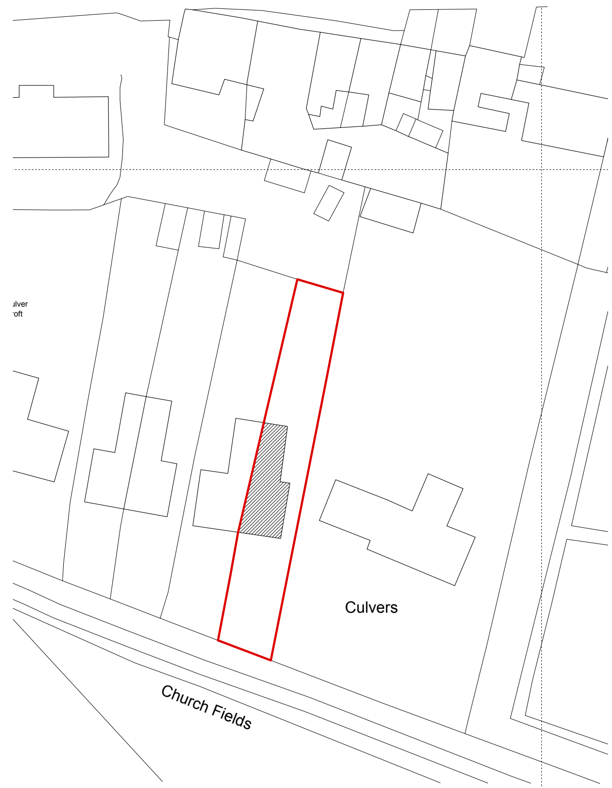
02 Proposed site block plan 1:500

Drawing title Location Plan Proposed Block Plan Scale @ A3 See sheet Project_Drawing No 1803_0010 Drawn by NA Rev P1