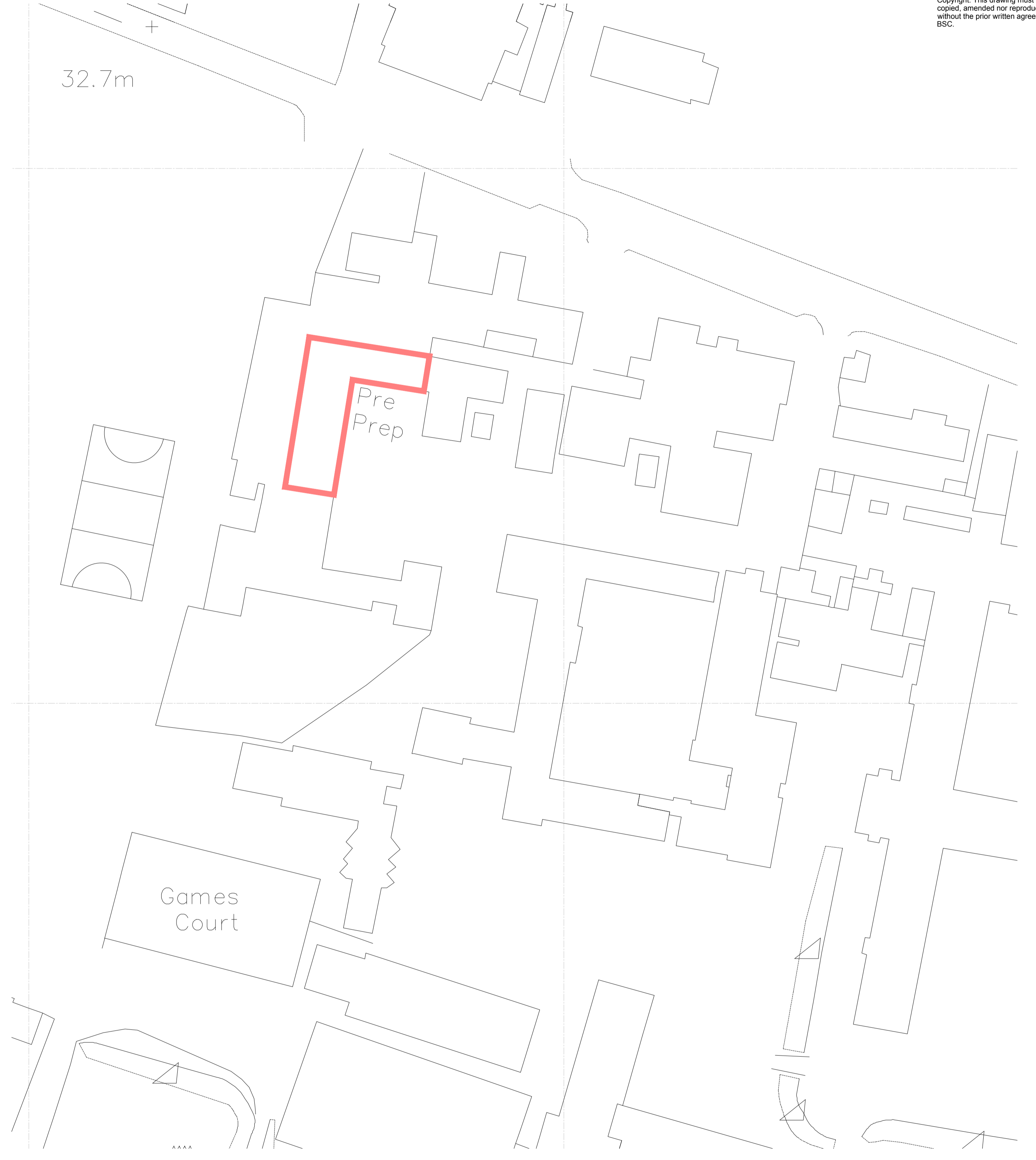
SITE PLAN Scale 1:500