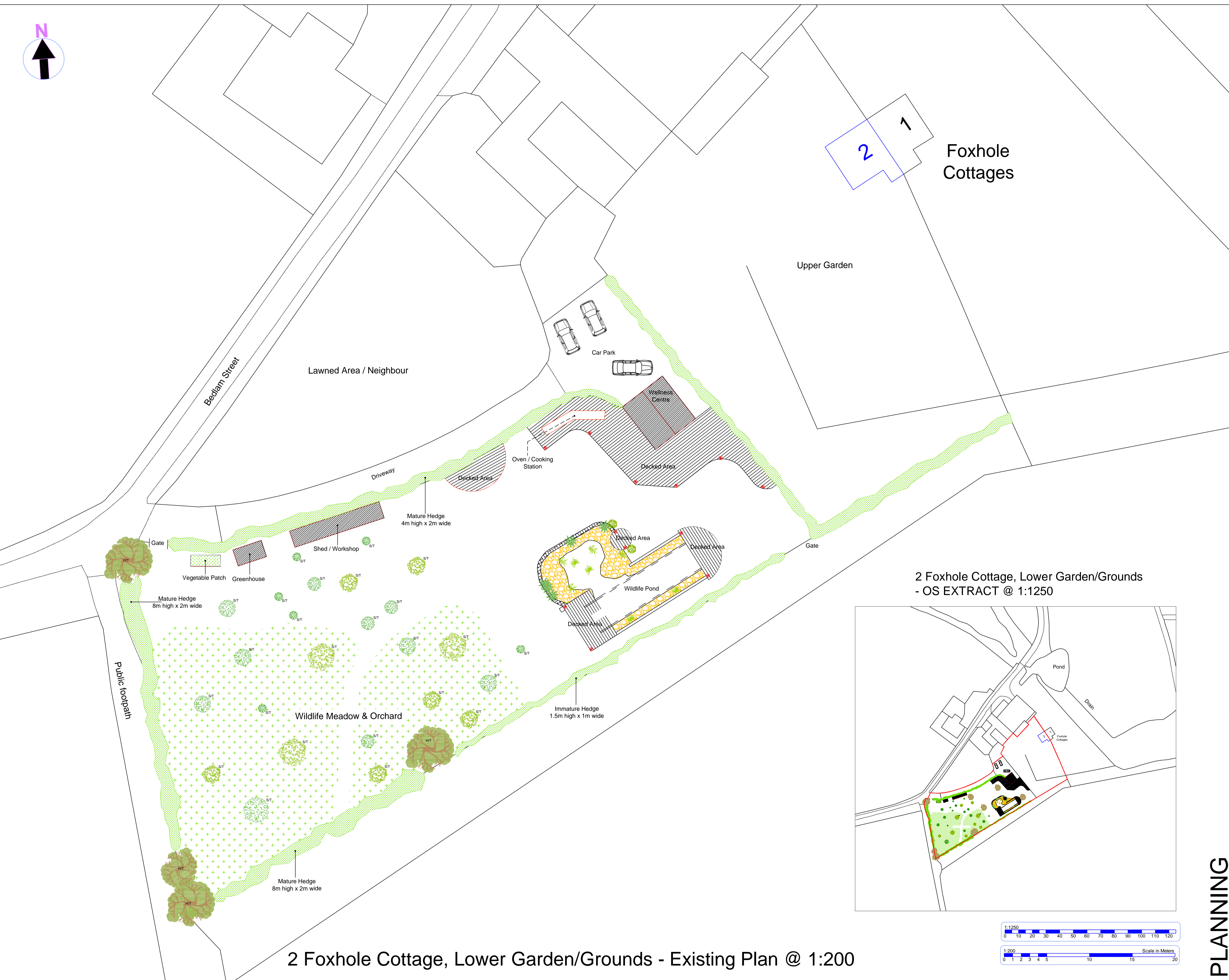
2 Foxhole Cottage, Lower Garden/Grounds - OS EXTRACT @ 1:1250