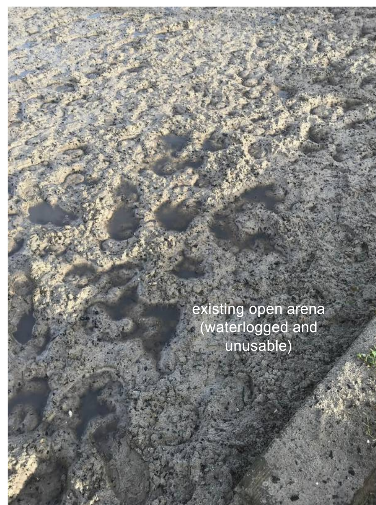
existing open arena (waterlogged and unusable)