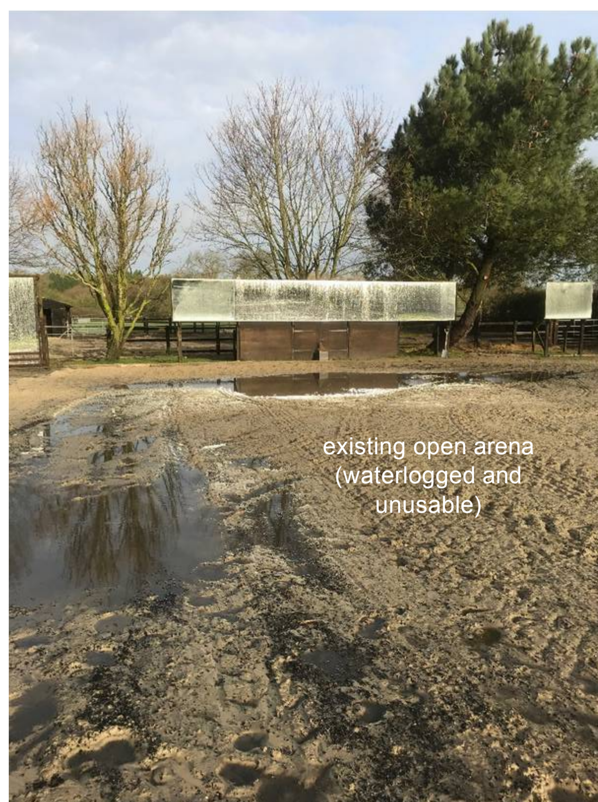
existing open arena (waterlogged and unusable)