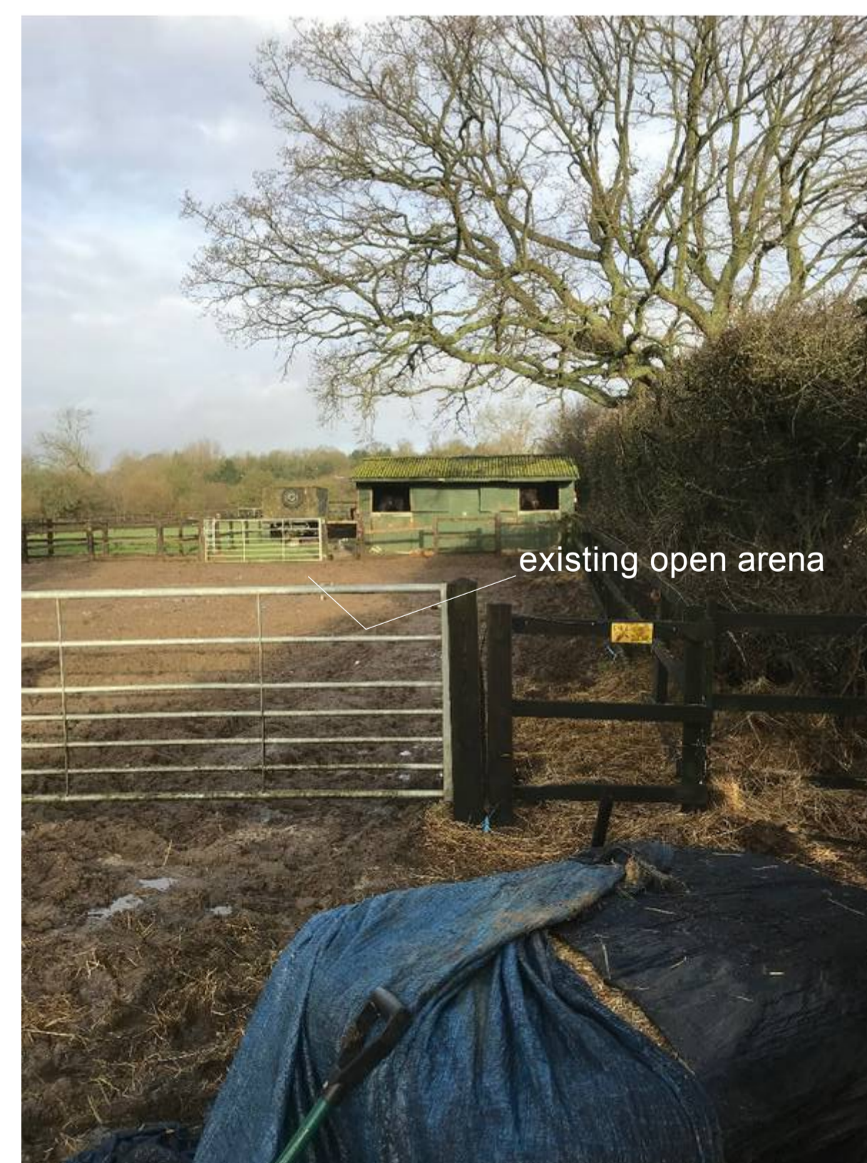
existing open arena