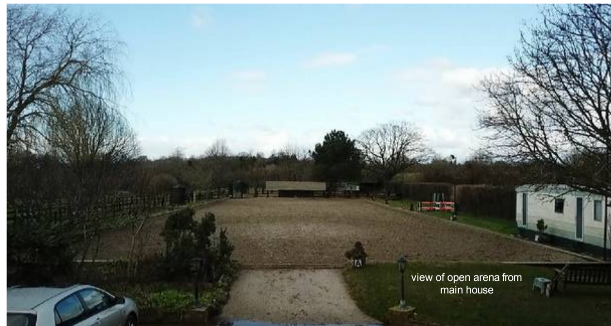
view of open arena from main house