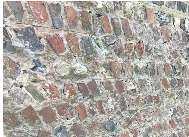
rough brick coursing to existing wall, in lime mortar with lime pointing