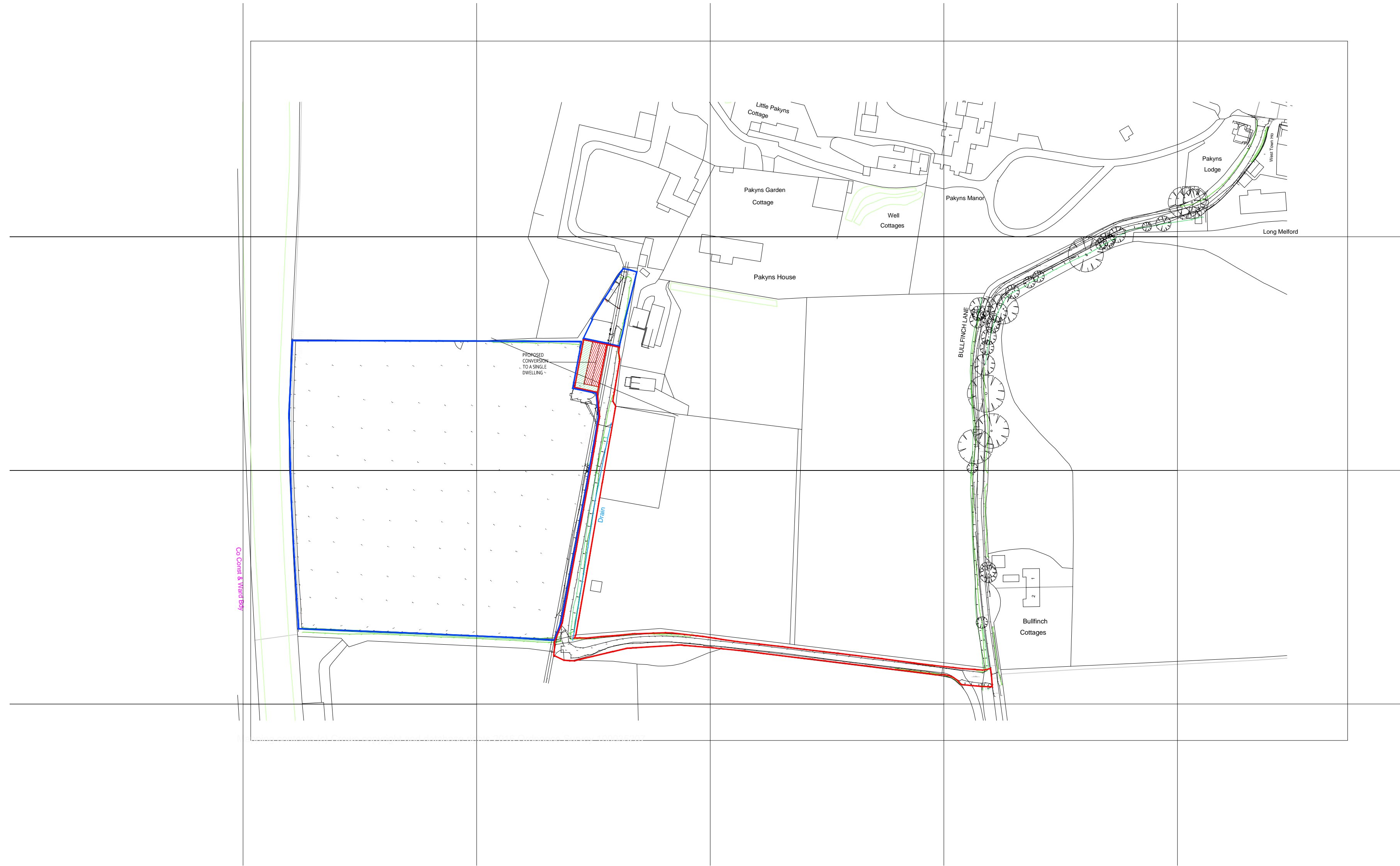
SITE LOCATION PLAN - AS PROPOSED SCALE @ 1:1250 ON AN A1 SHEET

NOTES: DO NOT SCALE OFF THIS DRAWING CHECK ALL DIMENSIONS ON SITE BEFORE ANY WORK IS COMMENCED. ALL GOODS MATERIALS AND WORKMANSHIP MUST CONFORM WITH CURRENT BUILDING REGULATIONS, BRITISH STANDARDS AND CODES OF PRACTICE. R.I.B.A BASIC SERVICES GIVEN/ NOT GIVEN. COPYRIGHT OF THIS DRAWING IS RETAINED BY GEORGE BAXTER ASSOCIATES LTD. AND IT MUST NOT BE REPRODUCED WITHOUT WRITTEN CONSENT.