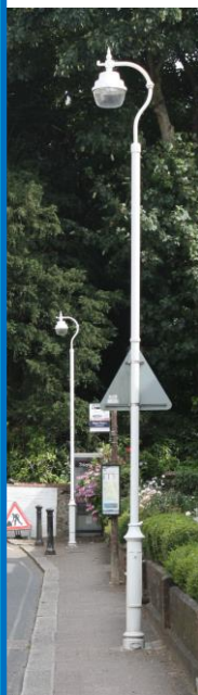
The photo shows a typical 'Heritage' style.

We are shortly starting to replace the 140 or so old streetlights around Hurstpierpoint and Sayers Common, with new LED versions. We will be using 'heritage' style columns (as in the High Street) in selected 'conservation' areas, and slimline style in others. This project follows the replacement last year of those lights owned by West Sussex County Council. The project is being financed by a £165,000 loan from the Public Works Loan Board, repaid over 20 years. We have calculated that the cost of the loan will be more than offset by the costs of maintenance and electricity use with the more efficient lights.